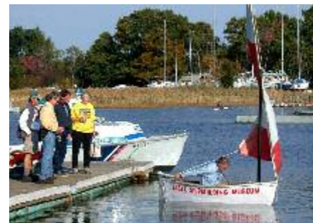
The gathered crowd watches the maiden voyage of the now sailing vessel Pita Pocket .