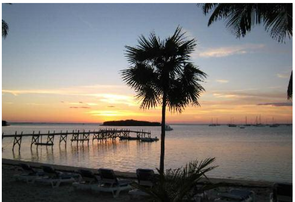
Sunrise over the Sea of Abaco from Guana Cay.