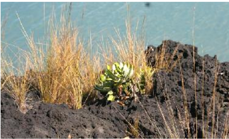
Life from the lava on Rangitoto volcano.

rainstorm, even with eight people on board.