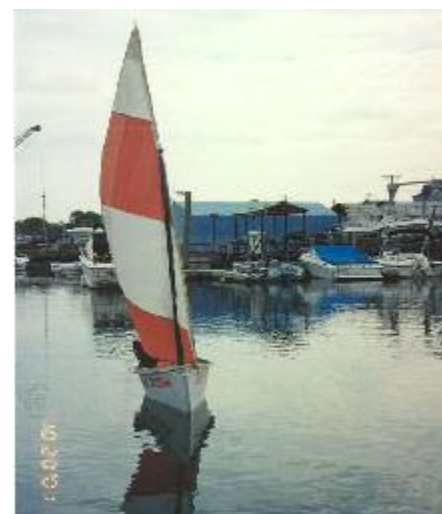
The Pita Pocket , powered up and at top speed.