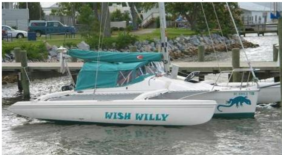
WishWilly with her "pup tent" in place at Oriental Harbor Marina

The drive to Oriental was pretty straightforward and uneventful for the most part. We went straight south on I-95 to New York City. If anyone had ever told me I'd be hauling 24' of folded Trimaran down the Cross Bronx Expressway in the middle of a weekday I'd have thought them out of their mind! It had been a coin toss whether to take the direct route across the George Washington Bridge or the longer more predictable trip over the Tappan Zee Bridge. And the GW won. As it turned out, it was reasonably easy, with just 20-30 minutes of stop-and-go traffic before the bridge. Thereafter, it was clear sailing down the Jersey Turnpike, over to the Eastern Shore of Maryland and, via Route 13, down the Delmarva Peninsula, where we spent the night. The second day saw us continue to the Chesapeake Bay Bridge Tunnel and on to Virginia Beach/Chesapeake, VA, area and Route 17 toward Elizabeth City, NC and points south. The drive through North Carolina was excellent with lots of scenery and country driving along the way. In several