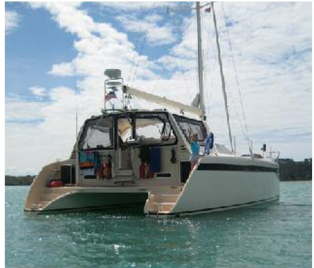
The “naughty lady”, 43' yacht Cattiva

The boat is docked at Gulf Harbour, about 20 miles north of Auckland, and we had 10-15 miles to