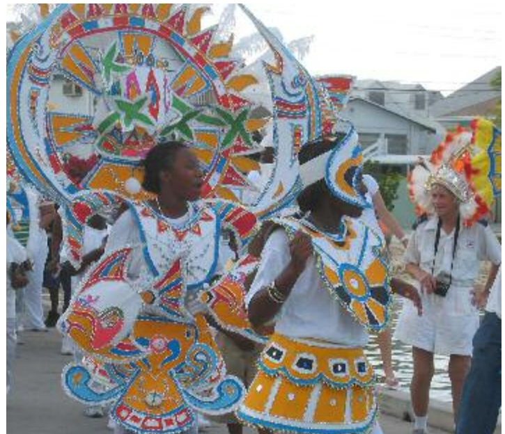
Junkanoo festival on Green Turtle Cay.