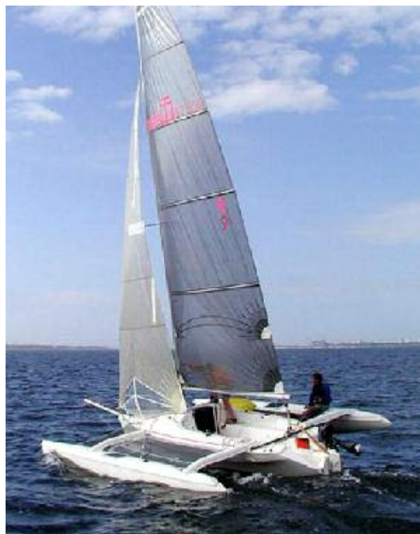
A Sprint 750 on the wind

Given that WishWilly is a day sailer with interior space next to the dagger board trunk and a V-berth, we soon discovered that the investment in the dodger/bimini "pup tent"-like enclosure was money well spent. It provided privacy as well as protection from the occasional rain. We did, however, learn that the canvas seams had a tendency to weep and drip into the cockpit in prolonged rain. A quick trip to the local marine store in town for a 10x10 poly tarp a poly tarp "fly" to put over the boom solved that problem. We spent the best part of five days sleeping on the boat in our "pup tent", taking full advantage of the 7' bench seats in the cockpit – the V-berth being a little too close for comfort. We also discovered that cheese cloth made excellent mosquito netting for those warm summer nights when the fully enclosed canvas was too tight, and I realized that a trip to my local canvas shop was in order for a set of inserts that could be zipped in to replace the solid sides for better ventilation. Meals were taken on the local economy, with breakfast at the marina nearly every day. The marina staff were well prepared to fix take-out meals for the days spent sailing in the local area. We opted to day-sail rather than heading off on longer trips – there was more than enough to hold our interest in the local area. As an added treat for me, being retired military, it was pretty cool having Marine jets flying overhead a good part