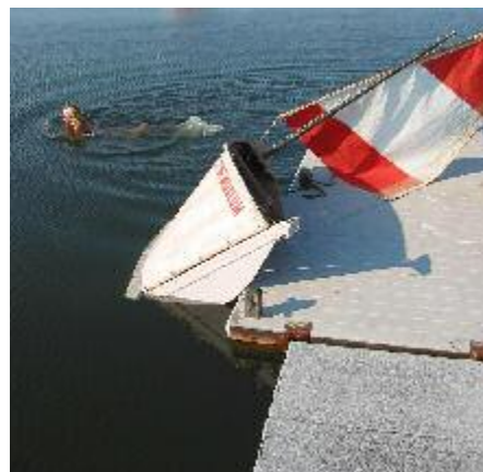
Loading ballast into the deep bilge brings the narrow boat upright.