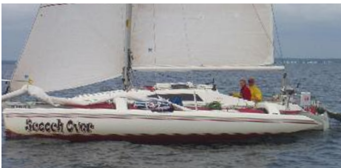
The Londons passing in the light winds of the "Fun Race"