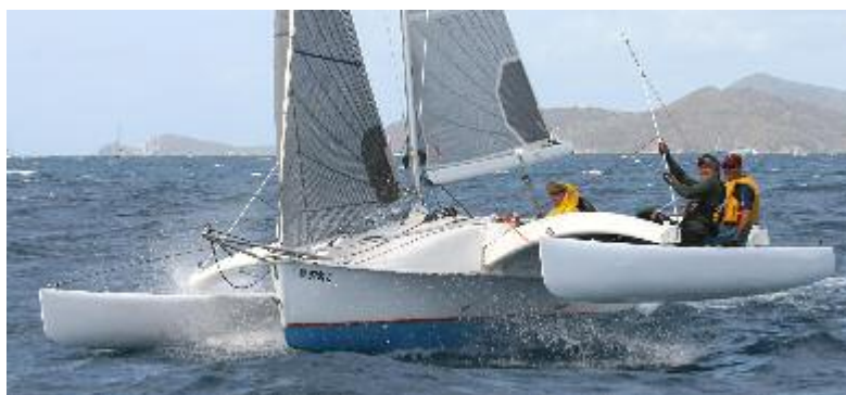
Anthony "Bones" Blake Photo