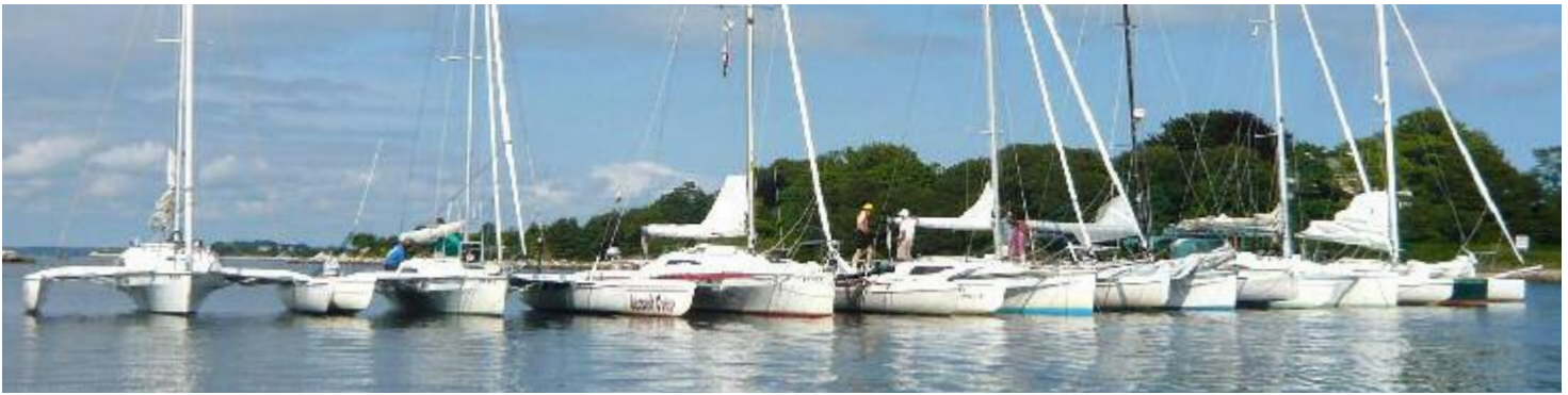
The seven-boat raft in Hadley Harbor at the end of the Cruiser's "Fun Race". 140 feet of trimaran available for strolling and socializing.