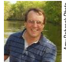
Amy Babcock Photo