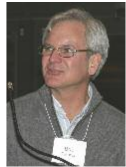
Tom Cox Photo