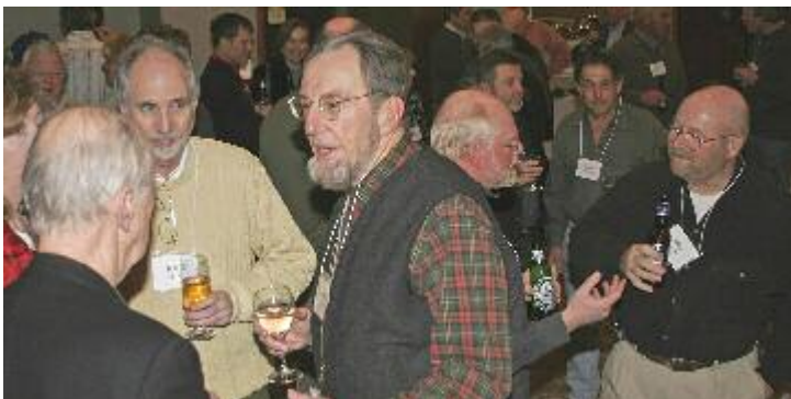
Over 100 NEMA members and guests attended the annual dinner at the Venezia Restaurant