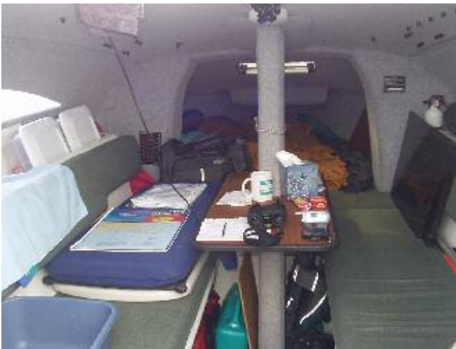
Cruising aboard a Corsair F-24 Mk II. Kitchen is to the left (stove not visible), pantry behind the set backs, dagger board table for eating and reading, bedroom is forward in the V-berth.